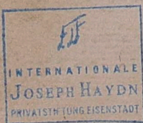
Abb. III: 19-24